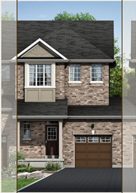
BLOCK 5 - ELEVATION C