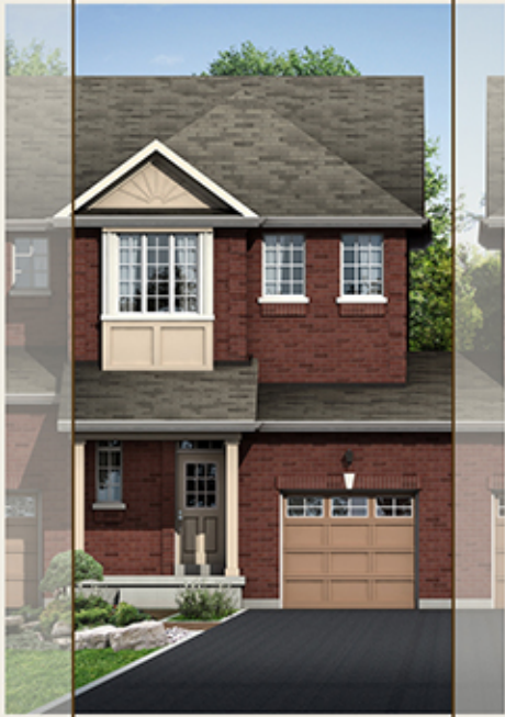
BLOCK 3 - ELEVATION C