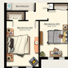
2ND FLOOR ELEVATION B