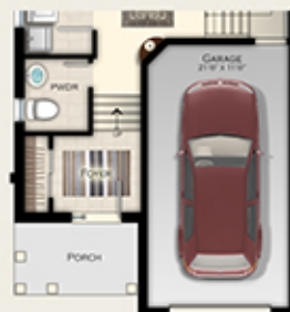
MAIN FLOOR ELEVATION B