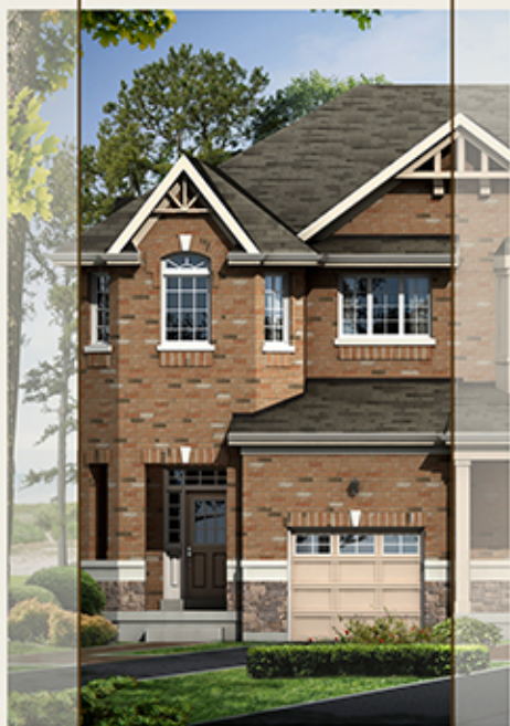
BLOCK 7 ~ ELEVATION A