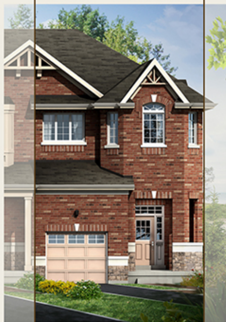
BLOCK 4 ~ ELEVATION B