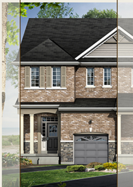
BLOCK 1 ~ ELEVATION B