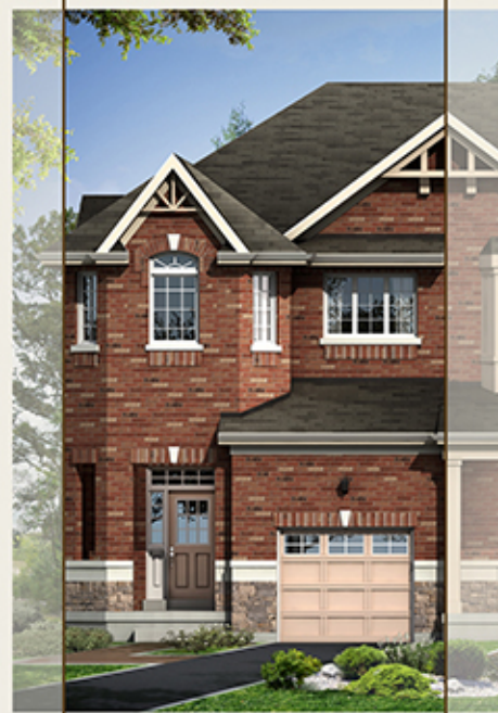
BLOCK 8 ~ ELEVATION A