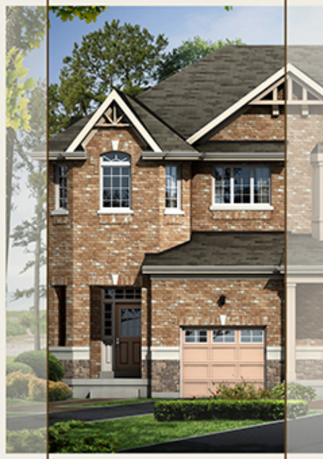
BLOCK 2 ~ ELEVATION A