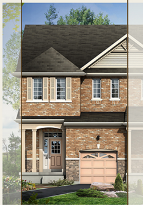
BLOCK 9 ~ ELEVATION B