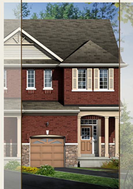
BLOCK 6 ~ ELEVATION B