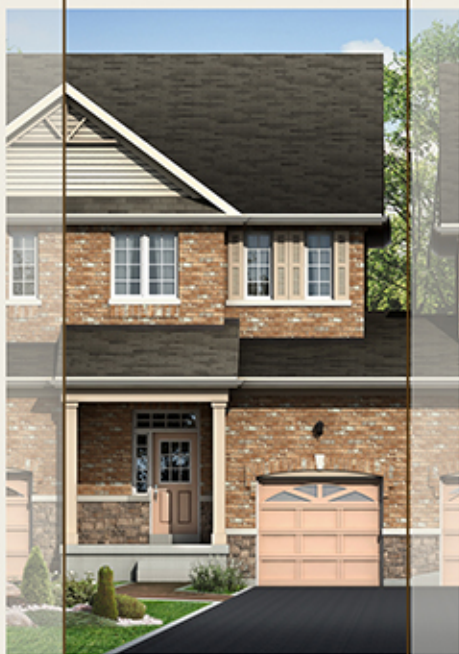
BLOCK 9 ~ ELEVATION B