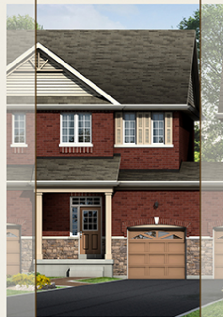
BLOCK 6 ~ ELEVATION B