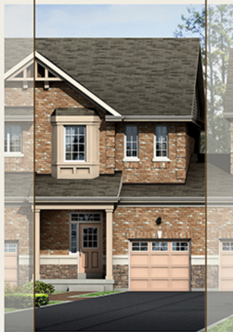
BLOCK 2 ~ ELEVATION A