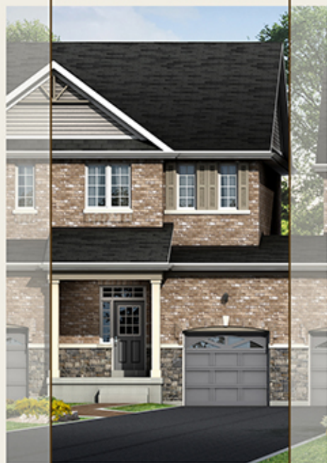
BLOCK 1 ~ ELEVATION B