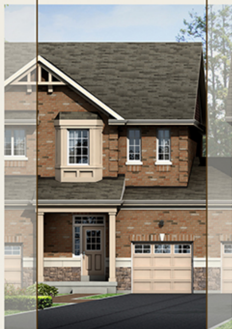
BLOCK 7 ~ ELEVATION A