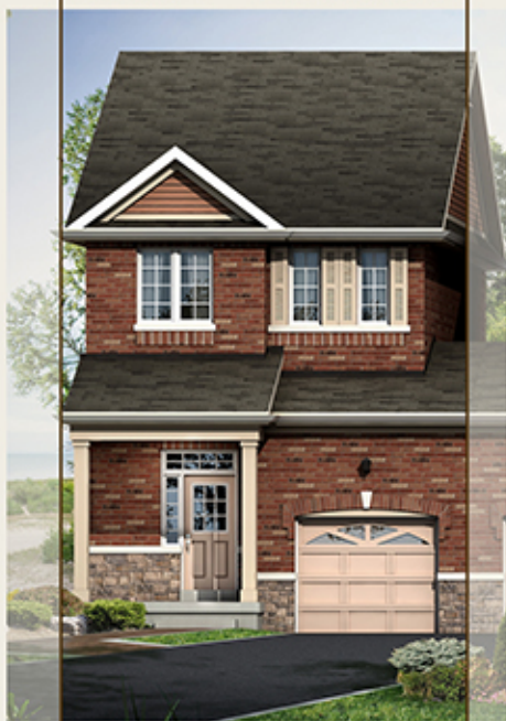
BLOCK 4 ~ ELEVATION B