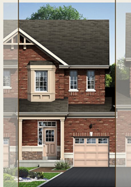
BLOCK 8 ~ ELEVATION A